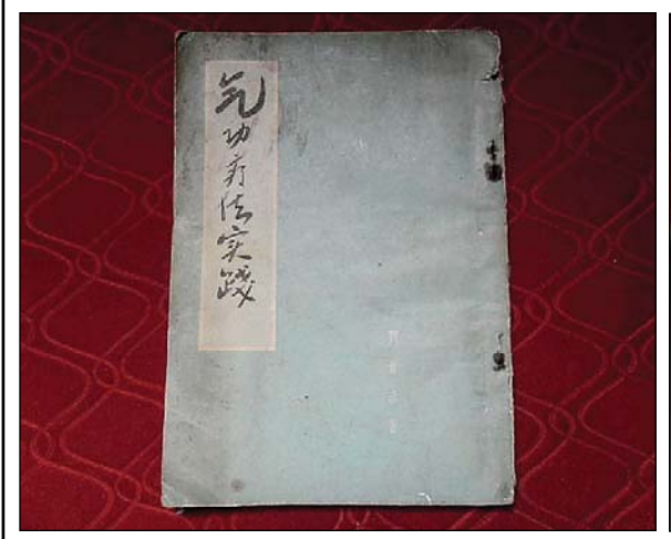
Qigong Therapy Practice - cover