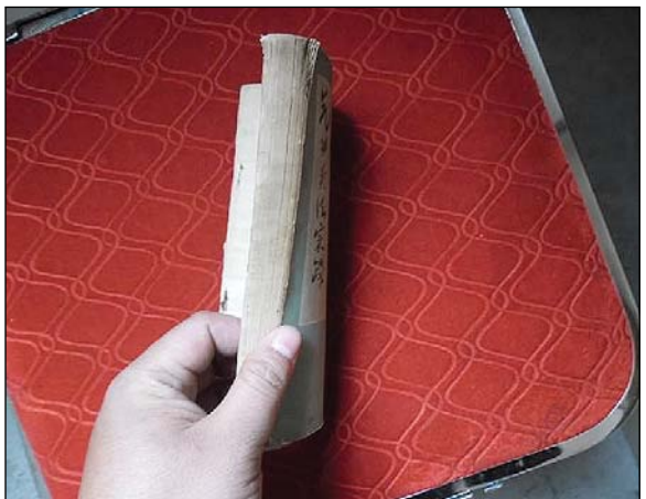
Qigong Therapy Practice - binding